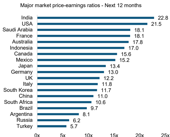
Source: Chart 1 – IBES consensus, in local currency. Correct as at 6 September 2021.

For further discussion of Chinese regulation please see our recent articles on The Journal section of our website ( https://www.platinum.com.au/Insights-Tools/The-Journal ).