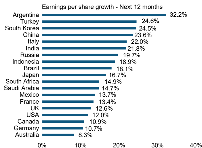
Source: Chart 2 – IBES consensus, in local currency. Correct as at 6 September 2021.